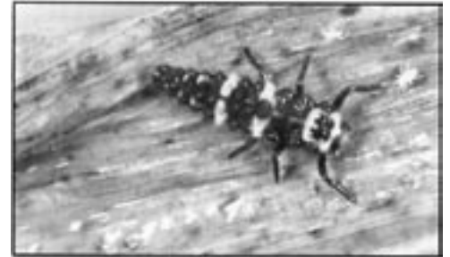
Larvae of a common LADYBIRD BEETLE . See color print, Fig. 24A, on publication B-1013.

Ladybird beetles are distributed throughout the world. The many species vary in their feeding habits. They prey on aphids, mealy bugs, scales, mites, and other soft-bodied insects. Several species are common to the area including Hippodamia convergens and an introduced species – the seven-spotted ladybird beetle, Coccinella septempunctata . The seven-spotted ladybird beetle and other species have been released to control pest species in the region.