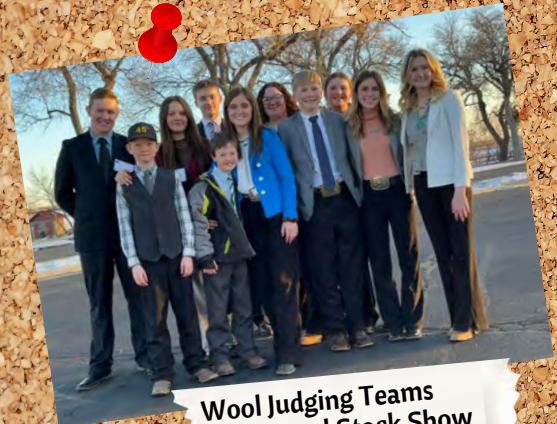
Wool Judging Teams at National Stock Show