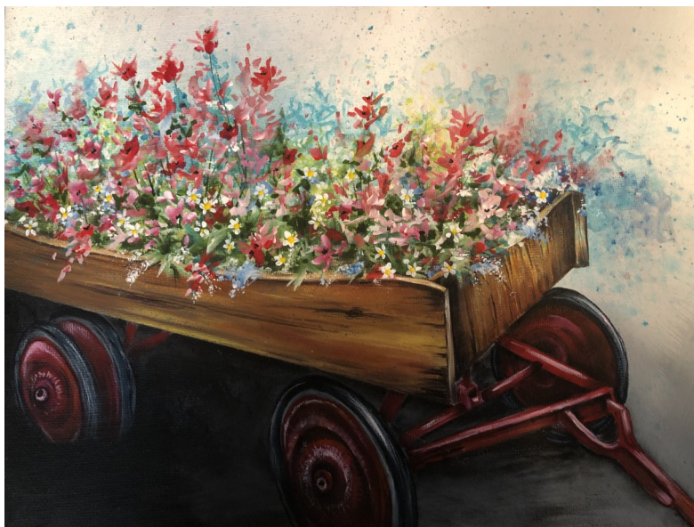
2021 Garden Walk Wagon painted by Linette West

"The University's policy has been, and will continue to be, one of nondiscrimination, offering equal opportunity to all employees and applicants for employment on the basis of their demonstrated ability and competence without regard to such matters as race, sex, gender, color, religion, national origin, disability, age, veteran status, sexual orientation, genetic information, political belief, or other status protected by state and federal statutes or University Regulations."