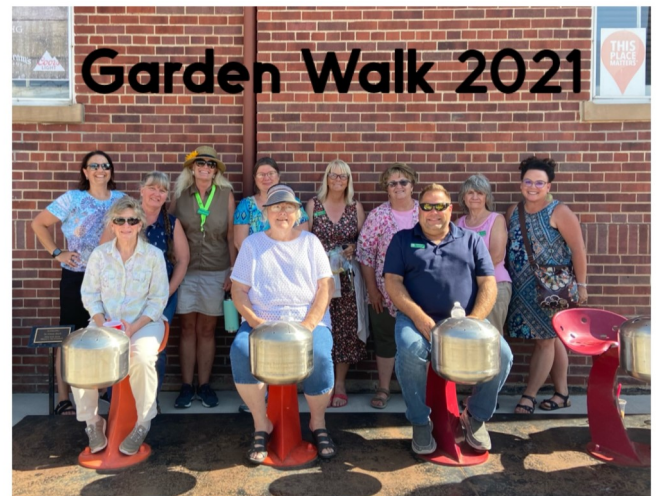
We managed to get a picture of some of the volunteers after the Garden Walk.