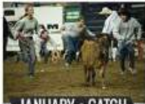
JANUARY • CATCH

40 PARTICIPANTS • 55 SUPPORTING SPONSORS • MORE THAN 3,000 STEERS AWARDED OVER 80 YEARS