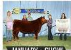
JANUARY • SHOW

NATIONALWESTERN.COM/CATCH-A-CALF-PROGRAM