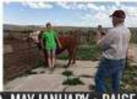
MAY-JANUARY • RAISE