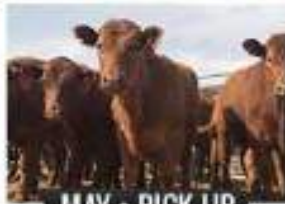
MAY • PICK-UP