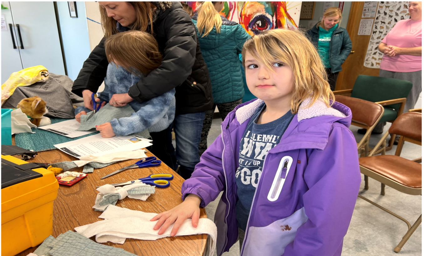
A “Cat” project meeting was held February 25th. Members went over showing a cat, grooming kits. Made a fun toy as well as cat tents.