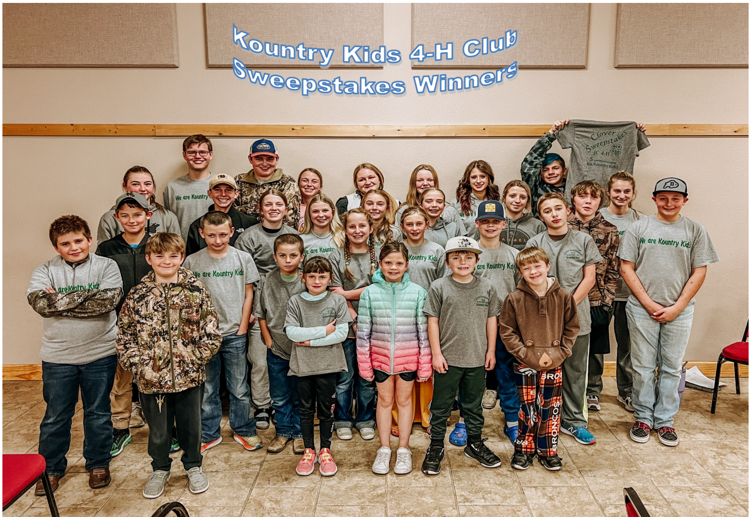
Kountry Kids 4-H Club Sweepstakes Winners