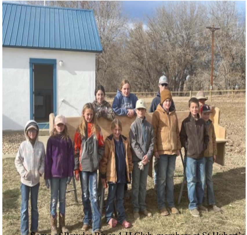
Some of Powder River 4-H Club members at St Hubert's Catholic Church