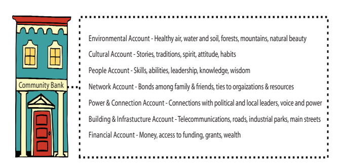
Figure 2. Community capitals "accounts"

seven accounts (fig. 2). Each bank account holds the strengths, skills, and opportunities available to and residing within community members. The contents of each account may be spent, invested, squandered, or used up, depending on how people choose to use these resources.