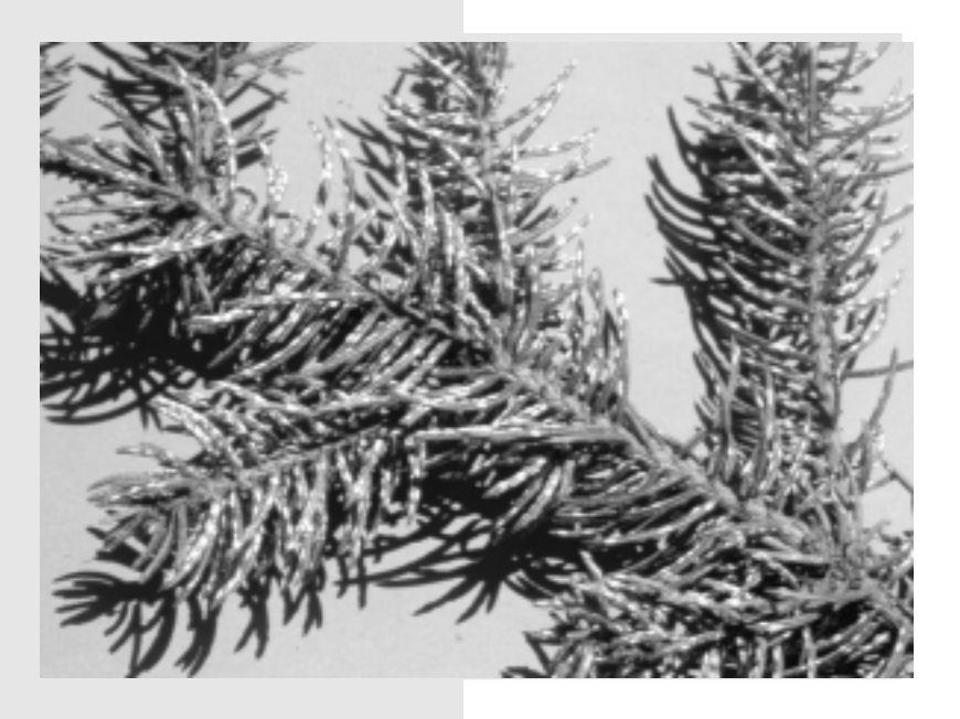
Figure 1. Pine needle scale.

common outside, in Wyoming. Pruning and maintaining plant vigor are often sufficient measures for controlling scale insects and mealybugs, but—if necessary—crawlers (the first nymphal form after hatching) can be treated with insecticides to reduce infestations.