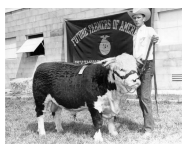
(a) 1957 Champion Hereford Bull at the Wyoming State Fair in Douglas, WY.