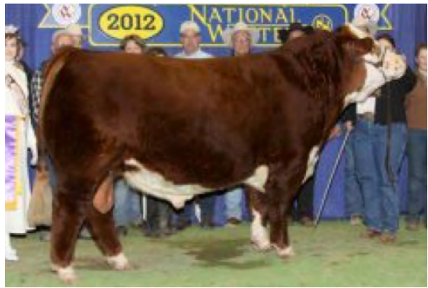
(b) 2012 Grand Champion Polled Hereford Bull at the National Western Stock Show in Denver, CO.

Figure 1 . Examples of selection for growth and size in beef cattle sires through time.