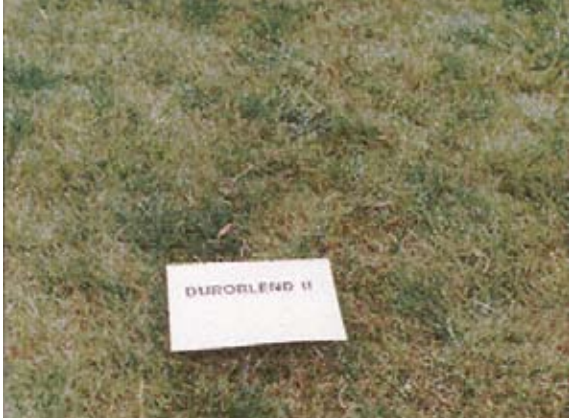
Photo 3. Durablend is a mixture of two Kentucky bluegrasses and a perennial ryegrass developed for low-maintenance turf. Sheridan R&E.