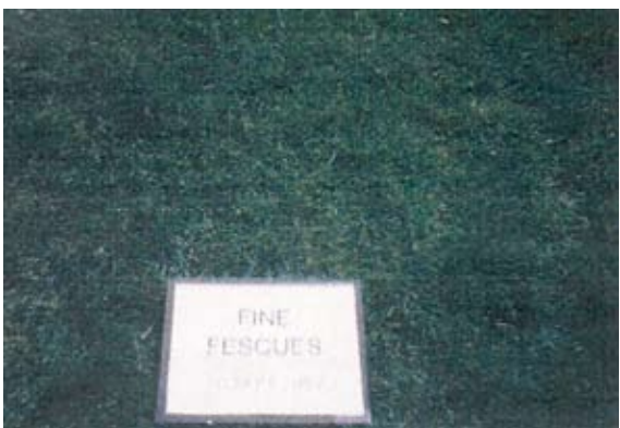
Photo 5. Mixture of fine fescues (sheep, chewings, hard, and red) of a lawn in Laramie. This lawn was established four years before and is watered, fertilized, and mowed about half as often and much as a Kentucky bluegrass lawn of similar quality.