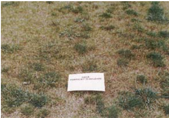
Photo 4. Kentucky bluegrass after three years of low maintenance at Sheridan R&E.