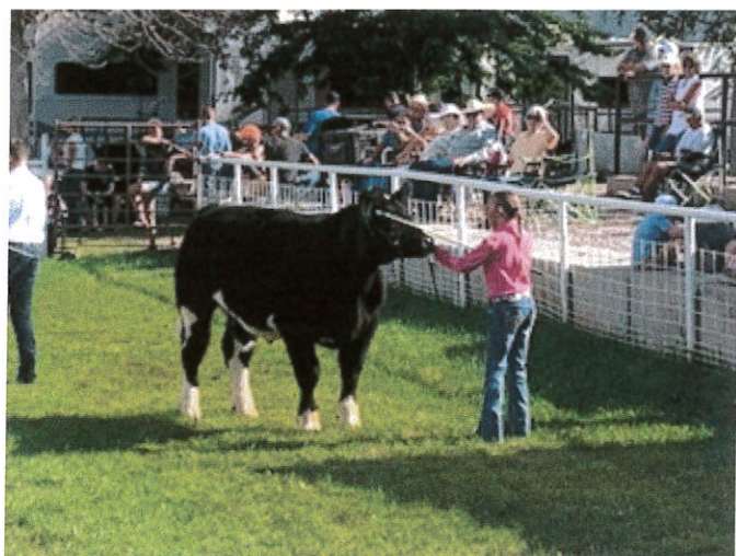
Showing Socks at County Fair