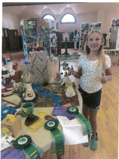
Champion Visual Arts State Fair Indian Village