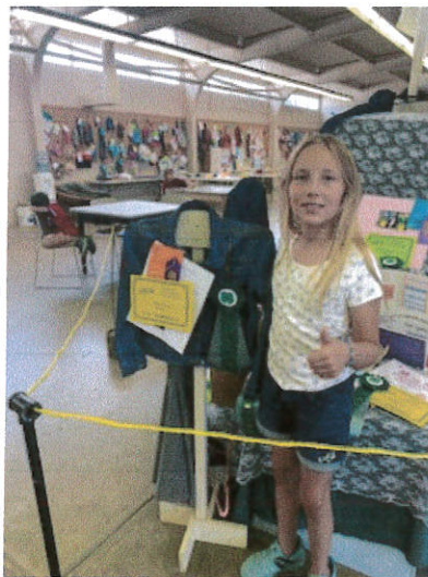
Reserve Champion State Fair Recycle/Embellished